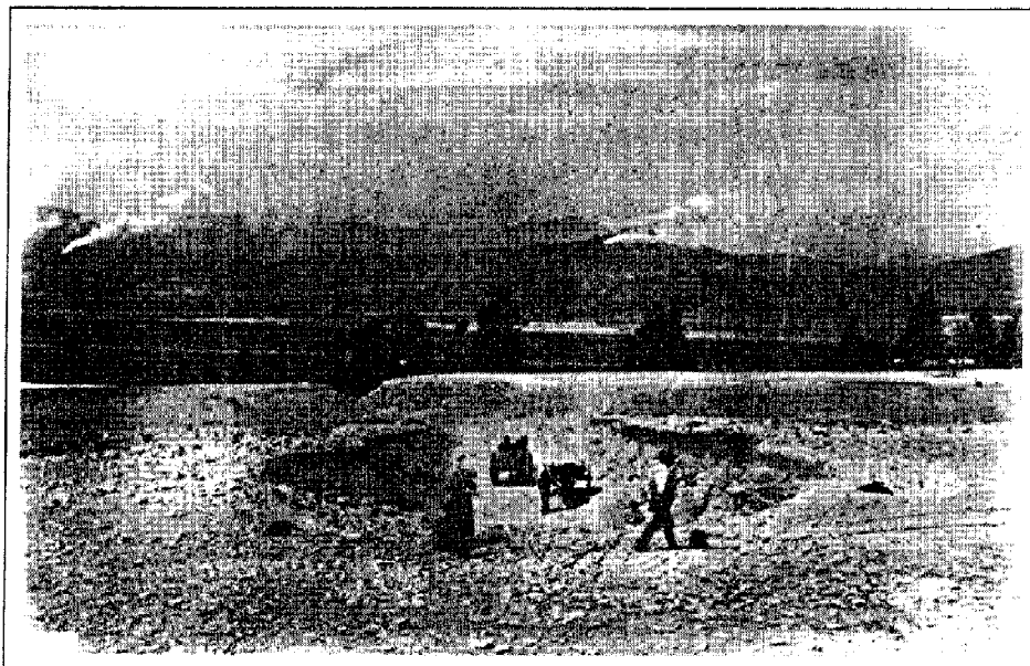
Figure 3 Copper-smelting operation at Anaconda in the early 1900's